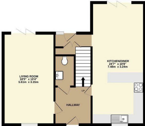
GROUND FLOOR 588 sq.ft. (54.7 sq.m.) approx.