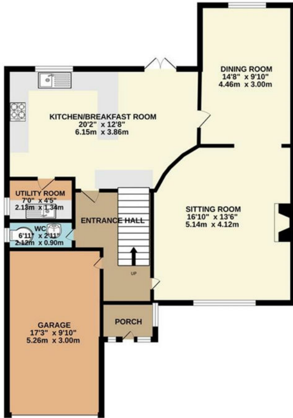
GROUND FLOOR 921 sq.ft. (85.6 sq.m.) approx.