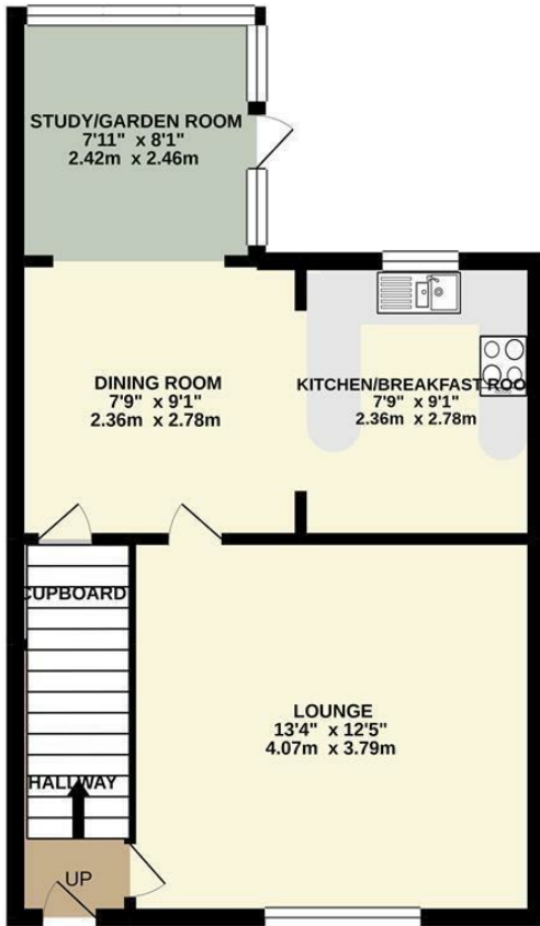
GROUND FLOOR 433 sq.ft. (40.2 sq.m.) approx.