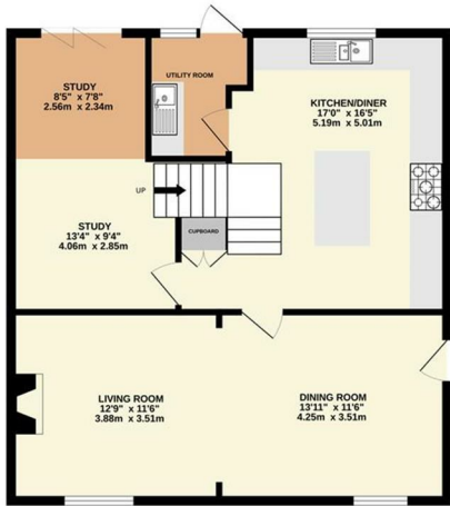
GROUND FLOOR 755 sq.ft. (70.2 sq.m.) approx.