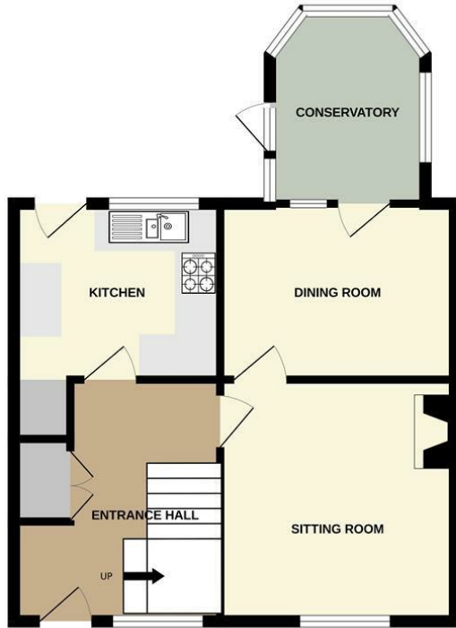
GROUND FLOOR 478 sq.ft. (44.4 sq.m.) approx.