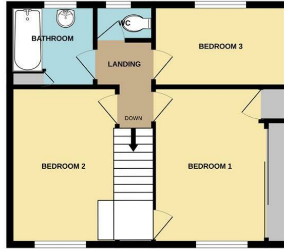
1ST FLOOR 461 sq.ft. (42.8 sq.m.) approx.