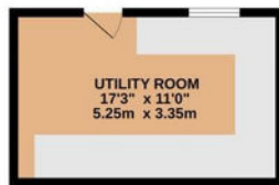
TOTAL FLOOR AREA : 2066 sq.ft. (191.9 sq.m.) approx.

Whilst every attempt has been made to ensure the accuracy of the floorplan contained here, measurements of doors, windows, rooms and any other items are approximate and no responsibility is taken for any error, omission or mis-statement. This plan is for illustrative purposes only and should be used as such by any prospective purchaser. The services, systems and appliances shown have not been tested and no guarantee as to their operability or efficiency can be given. Made with Metropix ©2025