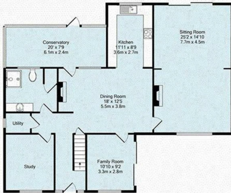
GROUND FLOOR APPROX. FLOOR AREA 1232 SQ. FT. (114.4 SQ.M.)