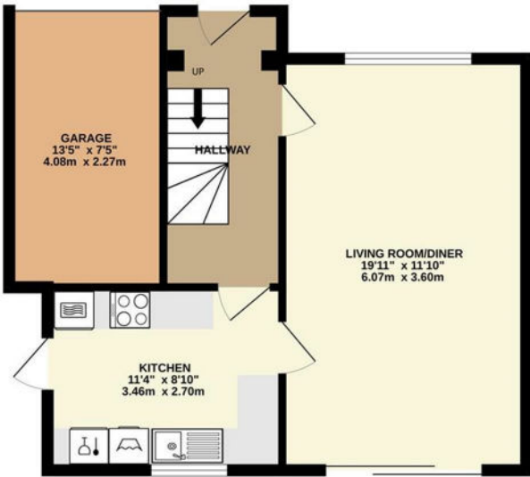
GROUND FLOOR 511 sq.ft. (47.4 sq.m.) approx.