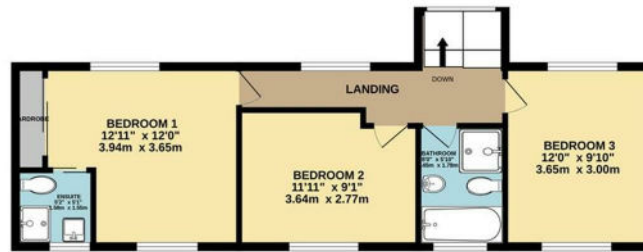
TOTAL FLOOR AREA : 1077 sq.ft. (100.1 sq.m.) approx.

Whilst every attempt has been made to ensure the accuracy of the floorplan contained here, measurements of doors, windows, rooms and any other items are approximate and no responsibility is taken for any error, omission or mis-statement. This plan is for illustrative purposes only and should be used as such by any prospective purchaser. The services, systems and appliances shown have not been tested and no guarantee as to their operability or efficiency can be given. Made with Metropix ©2026