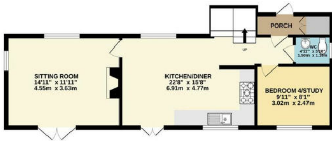
GROUND FLOOR 547 sq.ft. (50.8 sq.m.) approx.