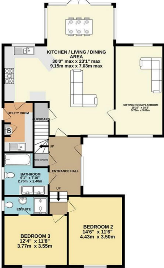
GROUND FLOOR 1305 sq.ft. (121.3 sq.m.) approx.